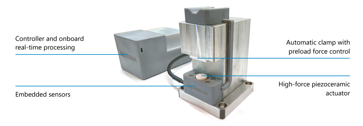
Figure 1. Components of the pr.DMA

The embedded real-time microcontroller is responsible for the automatic clamping system with preload force control, for driving the piezoceramic actuator and for acquiring the data from the sensors. The high sampling rate (>100 kHz) allows a precise measurement of the phase angle between stress and strain. The calculation of the complex modulus of the material as a function of frequency is performed onboard.